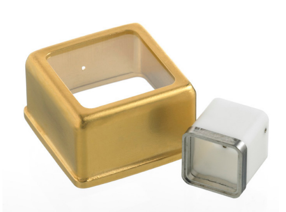
Matching the thermal properties of glass to metal in these hermetic seals is critical to successful performance.

The development of any new material or component in a commercial setting is highly confidential. However, the process of development, of partnering with outside experts, is by nature intensely collaborative. Mutual trust and respect, energized by the thrill of developing something new that uniquely meets a need, can make the process a shared voyage of discovery that pays big dividends in performance and commercial success.