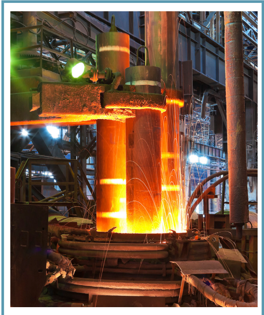
Refractory metal fasteners can be used in very demanding applications.

[11] http://www.azom.com/article.aspx?ArticleID=1175