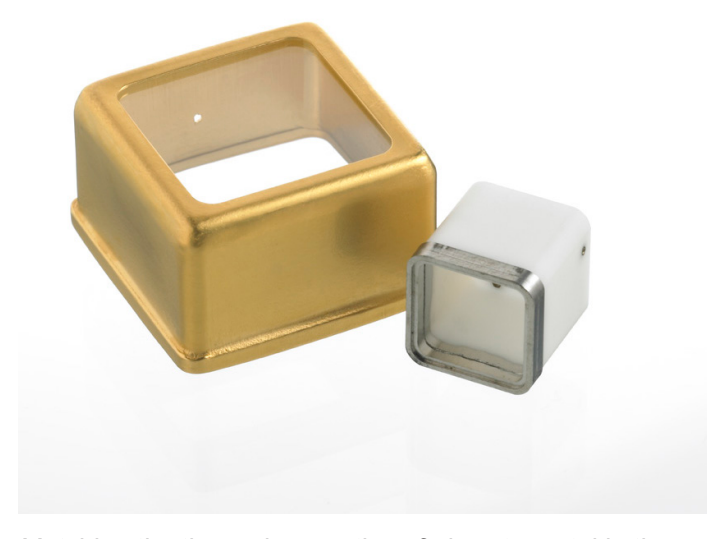
Matching the thermal properties of glass to metal in these hermetic seals is critical to successful performance.